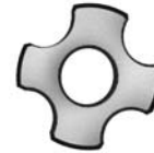
Silver, NOT Brass